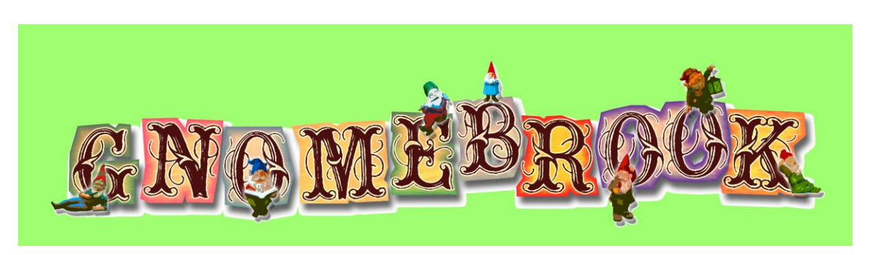
The Garden Gnome Convention Movie

A colourful array of characters compete at the Australian Garden Gnome Convention.